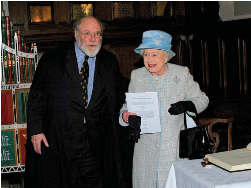
The Queen in Brasenose