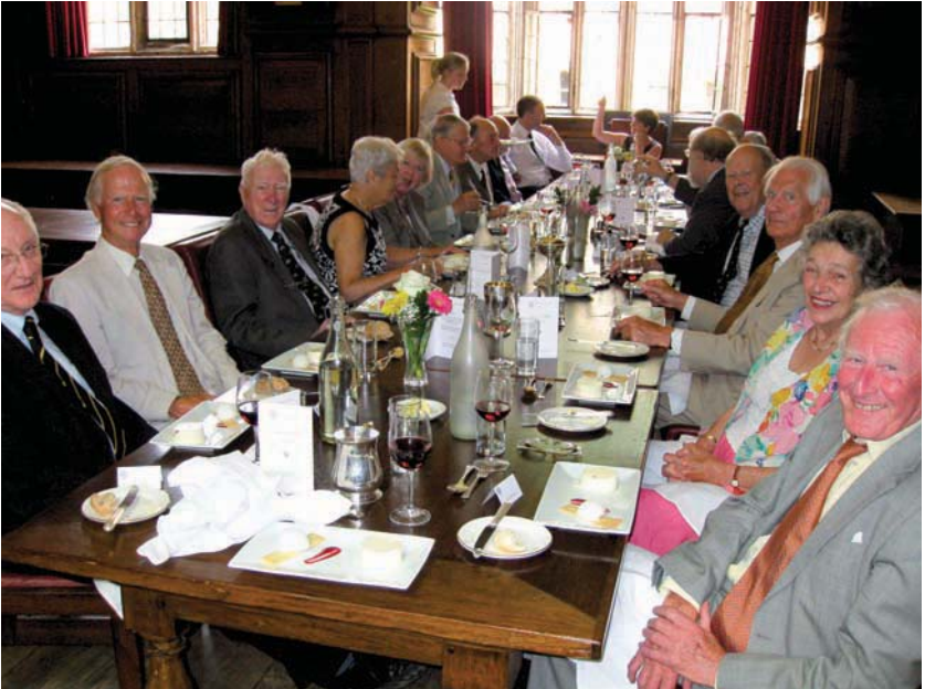
The 49ers in Hall