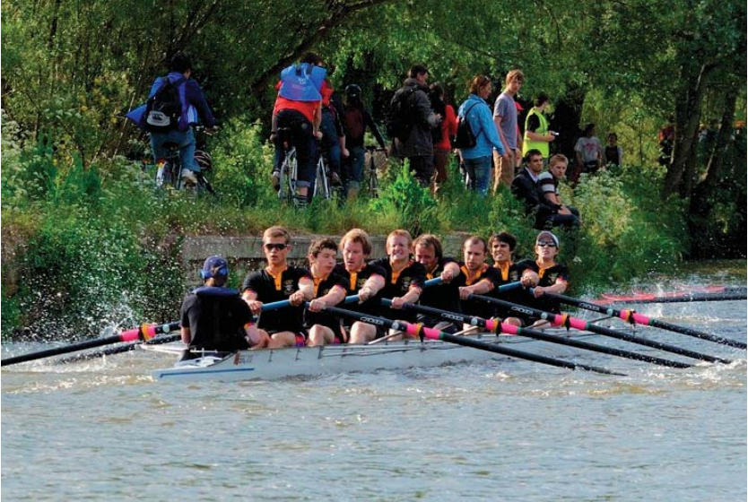
Brasenose winning the 1815 challenge plate against Jesus