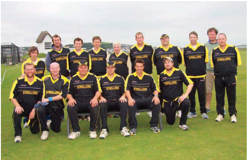
The Strollers, in all their glory!