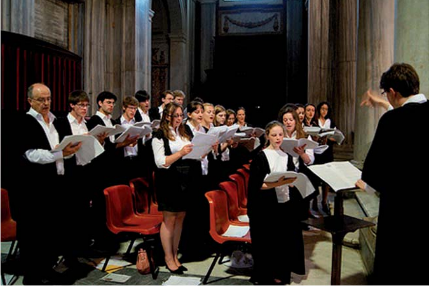
Brasenose Choir in the Basilica of Santa Maria Maggiore