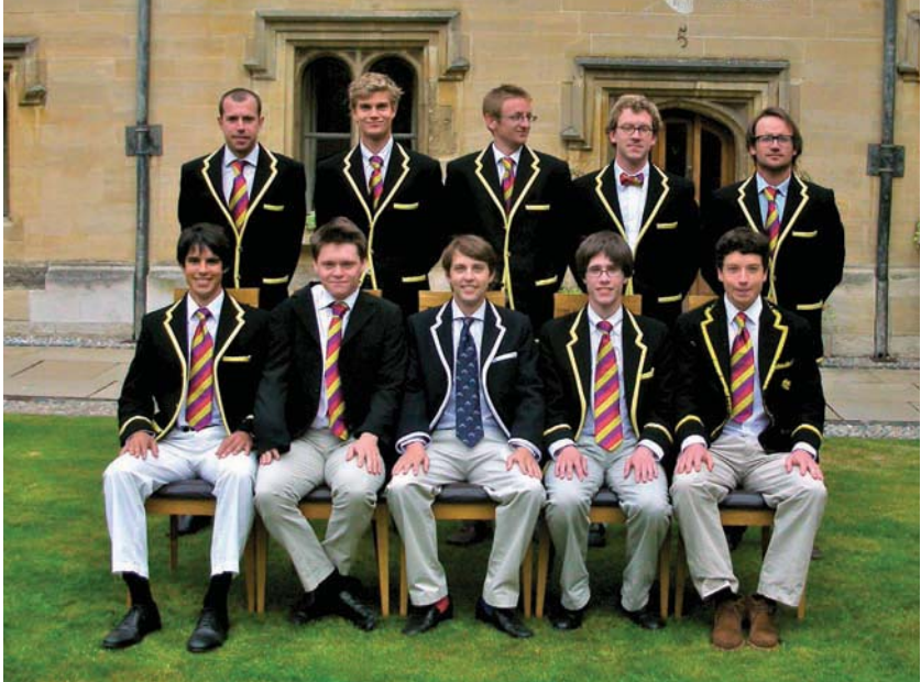
The Men's First VIII