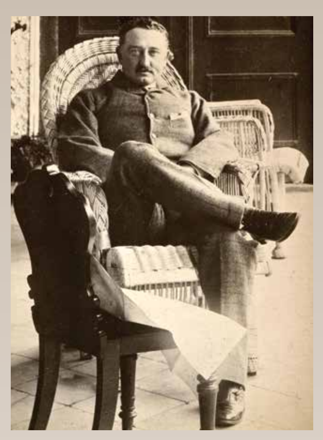
△ Cecil Rhodes.