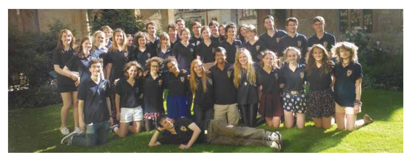
△ Open Day student hosts 2012

The ST's job is summarised easily in a couple of sentences. I'm responsible for ensuring that Brasenose admits the brightest students, regardless of background, and enables them to reach their potential. As graduates, we hope they will go on to make a difference in fulfilling careers. I'm also responsible for ensuring that Brasenose attracts world-class researchers and tutors, world-class academics, working on remarkable projects that enhance knowledge and well-being. The trickier bit is delivering on this. I work closely with many individuals across the College and within the University, at lots of different levels. No two days