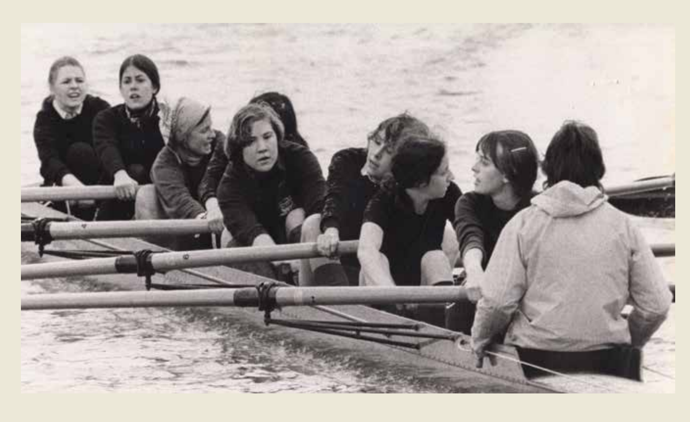
△ Women's VIII 1978

Reports from Clubs and Societies in The Brazen Nose indicate that women students immersed themselves in College activities from day one,