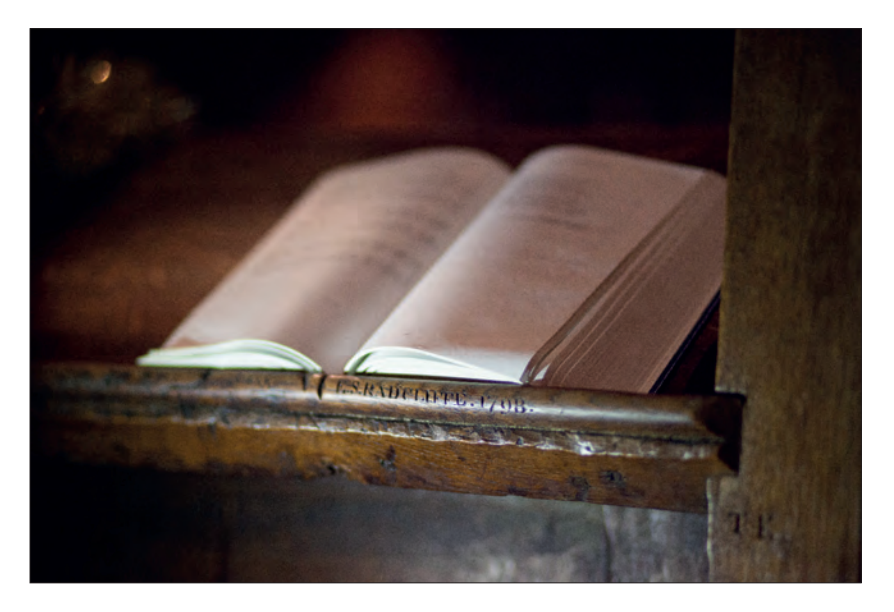
The name of Edmund Stringfellow Radcliffe, carved into a pew in the chapel.