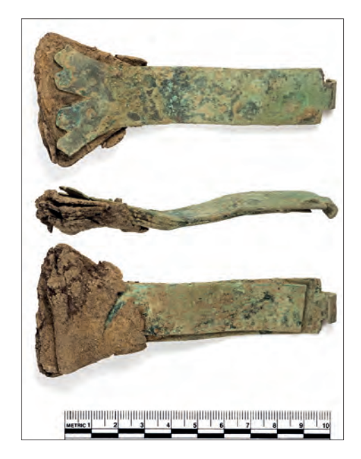
A book clasp, from what must have been a very large book, found by archaeologists investigating the site of a new accommodation block in Frewin, dating back to its previous existence as St Mary's College.