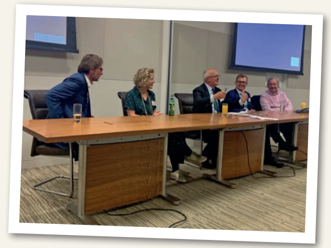
\Delta The Media Networking Panel Discussion in September

I love going to different parts of the UK (as well as abroad) to meet alumni. On 4th September, the train took me to Leeds and on the following day to Birmingham, where there were very spirited dinners in good restaurants.