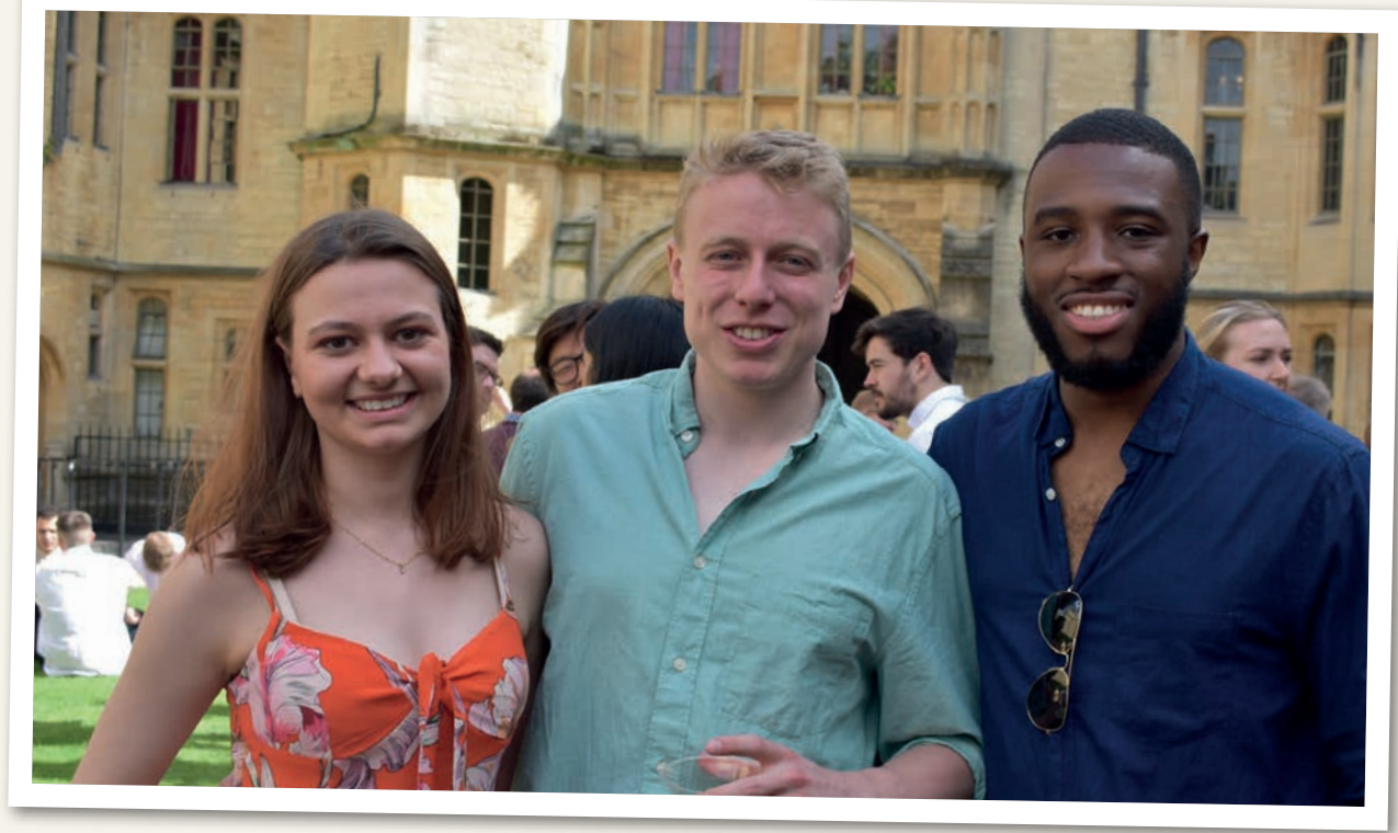
\Delta The JCR Garden Party in June

He first addressed a lunch for Fellows where he answered questions. Following that, he spoke to around 130 about the challenges faced by his country, which is one of the world's poorest but is keen to develop. A consistent strand of the speech was that the West (in particular its media) did not understand Africa. The President also emphasised his desire to stamp out corruption (which he said had been rampant under the predecessor regime) and to extend free education to all. He has set up an independent commission of inquiry focused on corrupt officials from past administrations, with the aim of recovering money that was pilfered from public funds, and using it toward the new development goals.