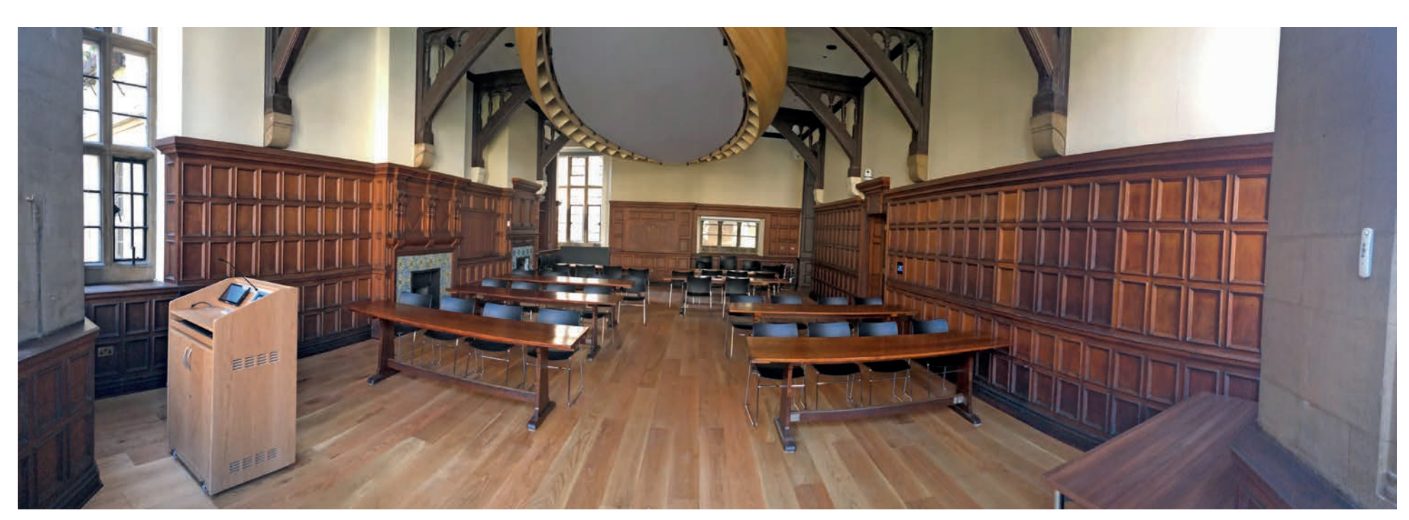
\Delta Formerly known as Lecture Room XI, and named after its generous donor, the redesign of the Amersi Foundation Lecture Room finished in May