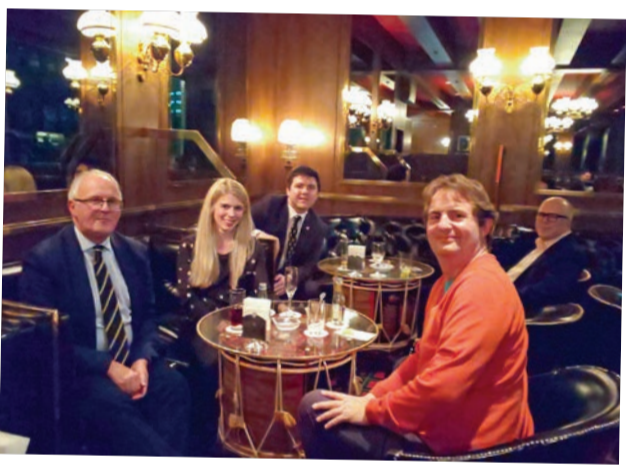
△ The BNC alumni reception in Tokyo

Round the fringes of the conference we held one-to-one meetings with seven alumni and held a reception for around fifteen alumni and friends. It was strange bumping into so many Oxford folk in the Hotel Okura in Central Tokyo.