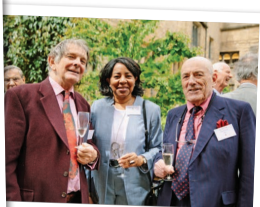
△ On 10th May, we celebrated 60 years and more since Brasenose with those that matriculated in 1959 and before.