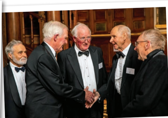
△ We welcomed matriculands from 1960-62 back to College for a lively Gaudy on 15th March.