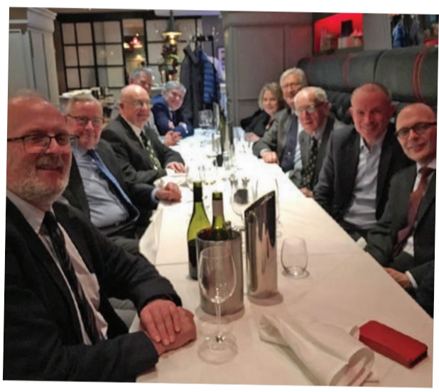
△ Alumni Dinner in Newcastle

I am keen to meet alumni in all parts of the UK. We have so far visited Edinburgh and Manchester for College events, and on 9th January it was the turn of Newcastle. We got a very warm welcome as is to be expected in the North East, with sixteen alumni attending a dinner at the excellent Café 21. They were of all ages and the conversation was terrific. Many had come from miles away.