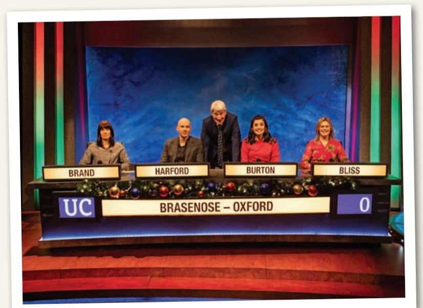
△ Our alumni team on University Challenge , aired on Christmas Eve 2018