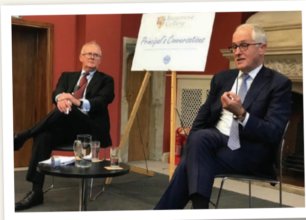
△ Honorary Fellow Malcolm Turnbull at his Principal's Conversation

Malcolm addressed a lunch for students and Fellows, in addition to a well-attended Principal's Conversation at the Oxford Martin School on 7th March. He covered a wide range of topics, including his time at Brasenose. Before the College, he had attended Sydney Grammar School which has a long connection with Brasenose, sharing the same colour tie – and the school even has a replica of the Brazen Nose still displayed.