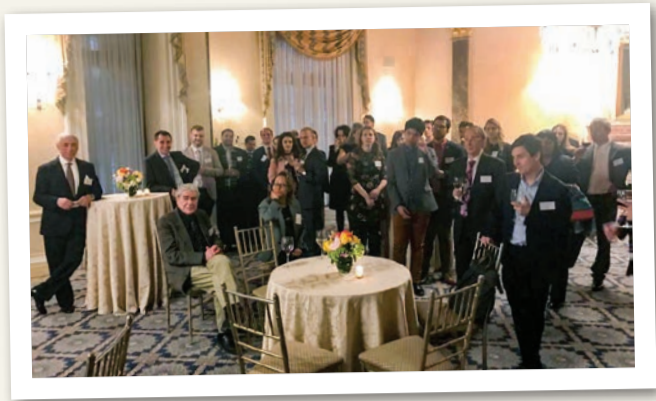
△ The BNC alumni reception in New York