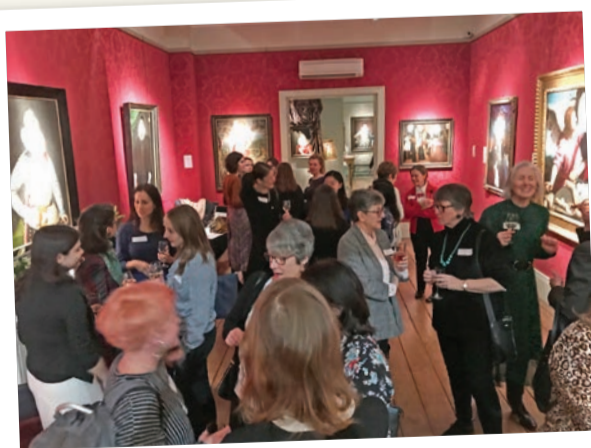
△ The Launch of the Women's 1974 Network at the Weiss Gallery in London