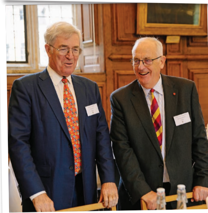
△ We celebrated five decades since Brasenose with those that matriculated between 1960-1969 on a wonderful afternoon in April.