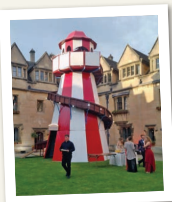
△ The Brasenose Ball on 11th May

On 11th May, I attended with some 1100 others the first part of the magnificent College Ball, and presided at the dinner. The theme was “Electric Dreams” which was (according to the blurb) all about “embracing your confusion and exploring the electric possibilities of your sub-conscious”. It is not often you open your bedroom door and find a helter skelter just outside the window – it took me