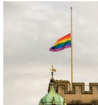
△ The rainbow flag flying in February.

MB: There isn't necessarily a stand-off between old and new. For instance, sub-fusc isn't gender specific now. I've never felt that being a BAME [black and minority ethnic] student at Brasenose is an issue – it's not like being in an airport! I do look around the tutors at some meetings I attend and recognise that often I'm the only BAME person