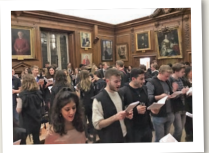
△ Ale Verses being sung in Hall

I remind readers that we always encourage alumni to send the Brasenose Library copies of their publications. There is a section in the Library which contains books by Brasenose Authors including two by yours truly.