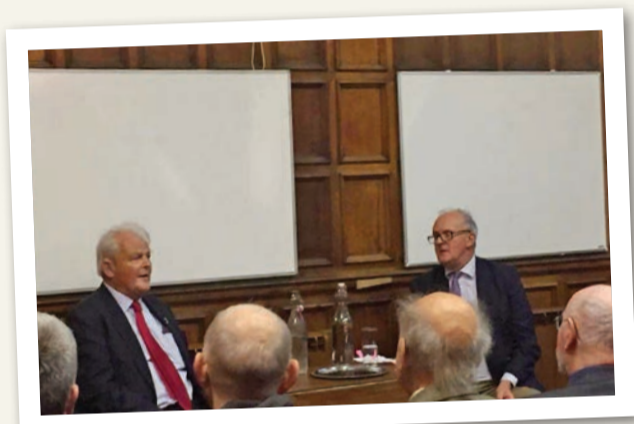
△ Bruce Kent in conversation.

Bruce Kent (Jurisprudence, 1949) the former General Secretary and then Chair of CND and an alumnus and Honorary Fellow of the College, addressed a Principal's Conversation on 25th October. I asked some searching and (I thought) difficult questions and the 88-year-old Bruce gave a very feisty set of responses.