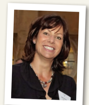
△ Claire Perry MP at a College event.