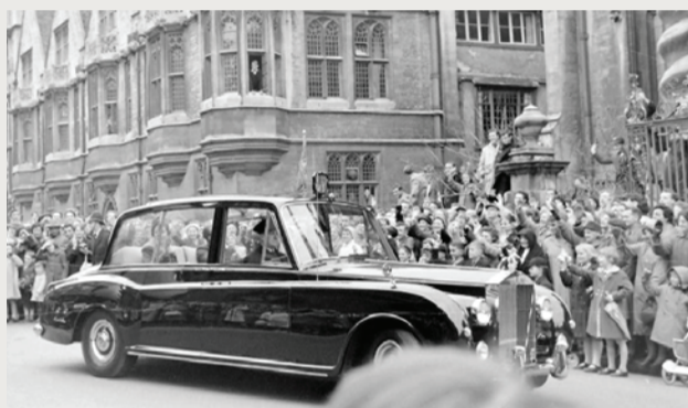
△ The Queen in Oxford in 1960

JF: Not an achievement at all, but in my year of office, in the summer of 1960, the Queen and the Duke of Edinburgh came to the University and all the college Presidents of JCR were invited to meet them. As I recall, the Duke was much easier to converse with than Her Majesty!