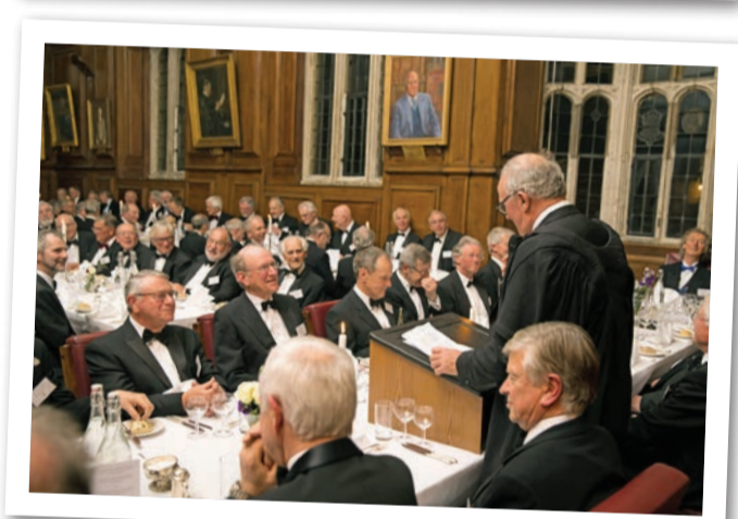
△ March saw a very lively Gaudy take place for those who matriculated between 1967 and 1969.