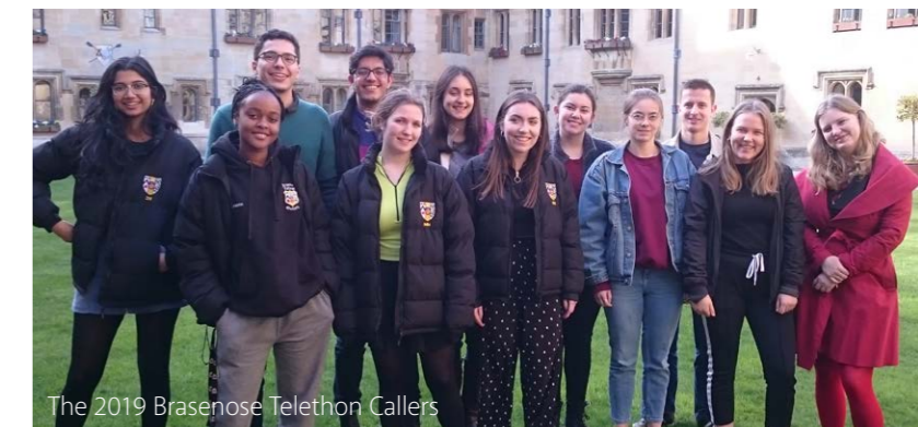
The 2019 Brasenose Telethon Callers

The next Telethon will be in March 2020. Keep an eye out for your postcard in the Spring with more information. To opt out, please contact the office using the above information.